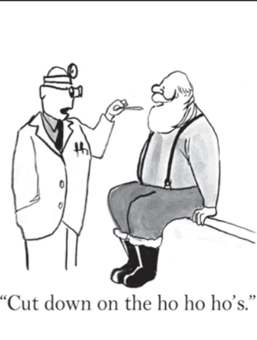
"Cut down on the ho ho ho's."

By adding more legumes to your diet, you can enjoy the many health benefits they offer. Experiment with different varieties to find your favourites and discover new and delicious ways to incorporate them into your meals.