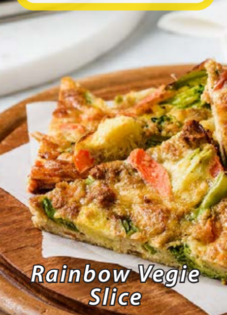
Rainbow Veggie Slice

Serves: 12 Preparation time: 5 mins Cooking time: 35 mins